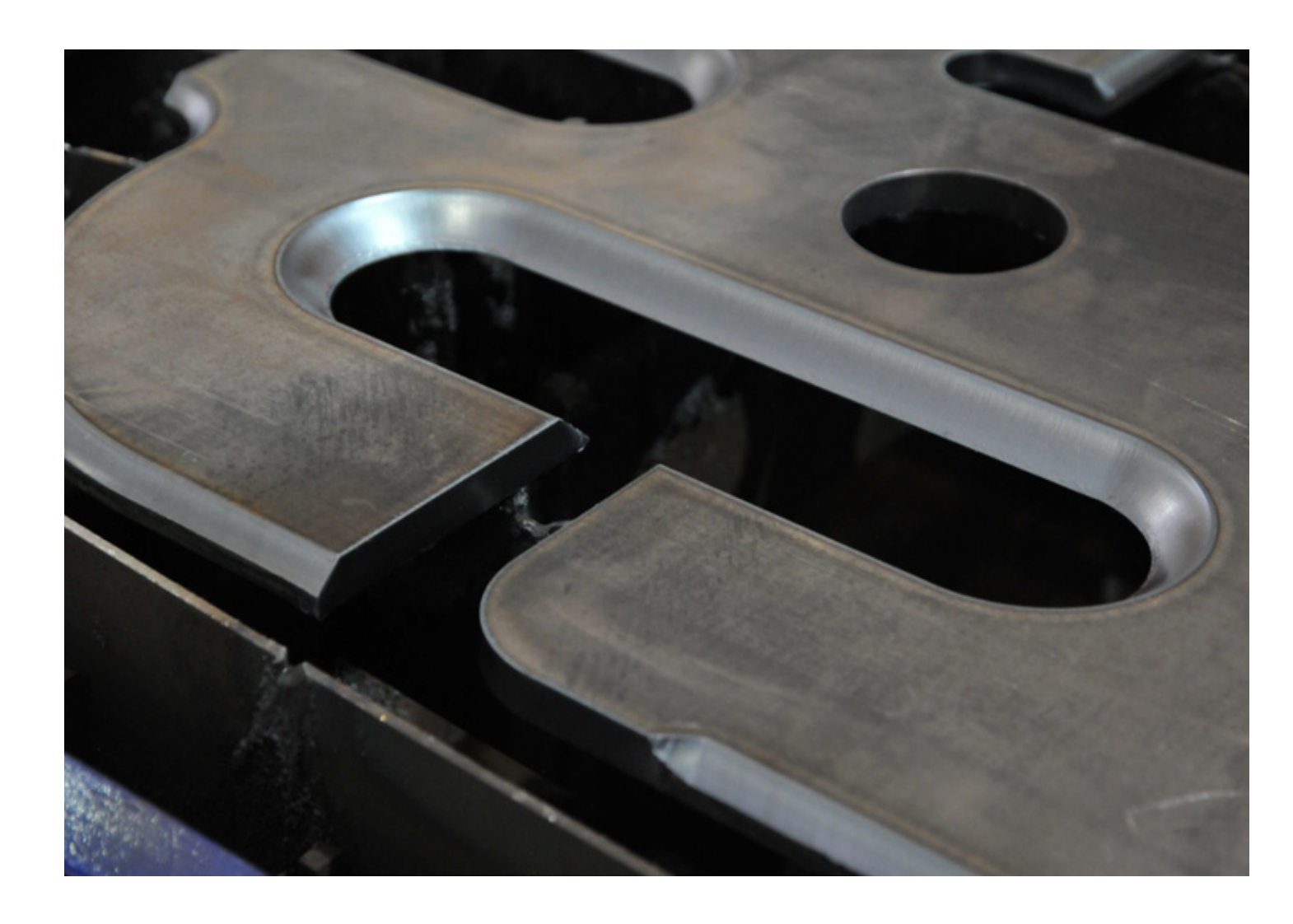
The MicroStep Rotator cutting head's degree of bevel varies for each technology it's paired with. For fiber laser and waterjet, 45-degree bevels are possible. For plasma, it's 50 degrees. For oxyfuel, it's 65 degrees.

Keep in mind, however, that each process technology - oxyfuel, plasma, waterjet and fiber laser - has a limited cutting capacity. For fiber, it's typically up to 1-in.-thick material while plasma is up to 2 in. and oxyfuel is over 2 in. As an example, if the material is 4 in. thick, the first straight cut would be