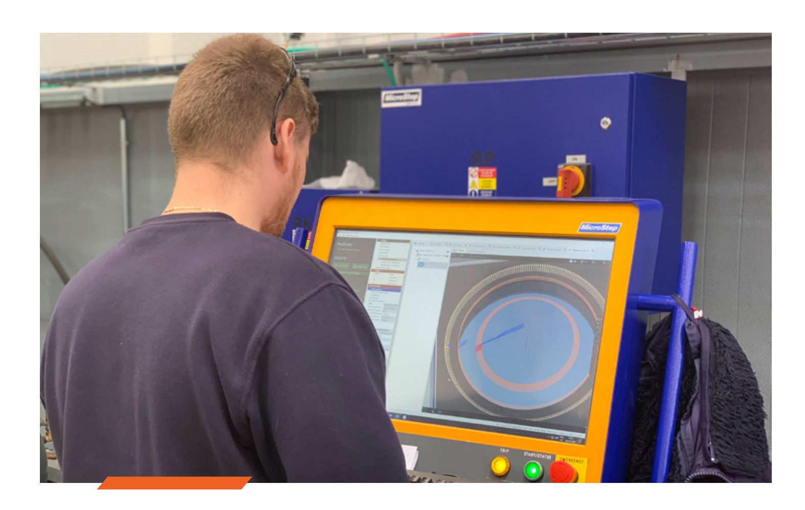
MicroStep's technology is able to create a detailed 3-D model of an object while fully describing its parameters, including any deviations from the ideal shape.

means that the real and ideal shapes of domes sometimes differ by several centimeters," Prevish says, adding that "conventional 2-D methods of positioning corrections via control of plasma arc voltage do not apply to 3-D cutting.